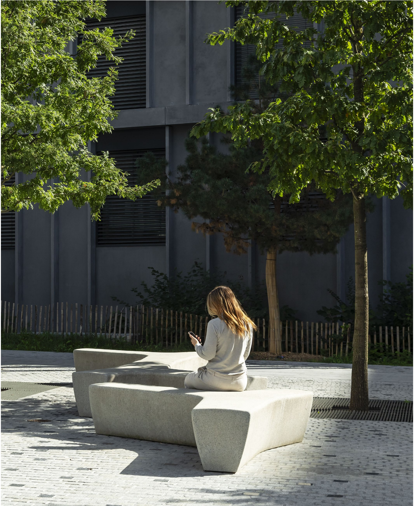
TWIG modular and landscape benches

Escofet produces the concrete that forms the family of benches, in their production plant located in Martorell, from Portland cement, sand and granite, combined with different additives and water.