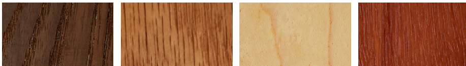
Domestically Sourced Thermally Modified Ash