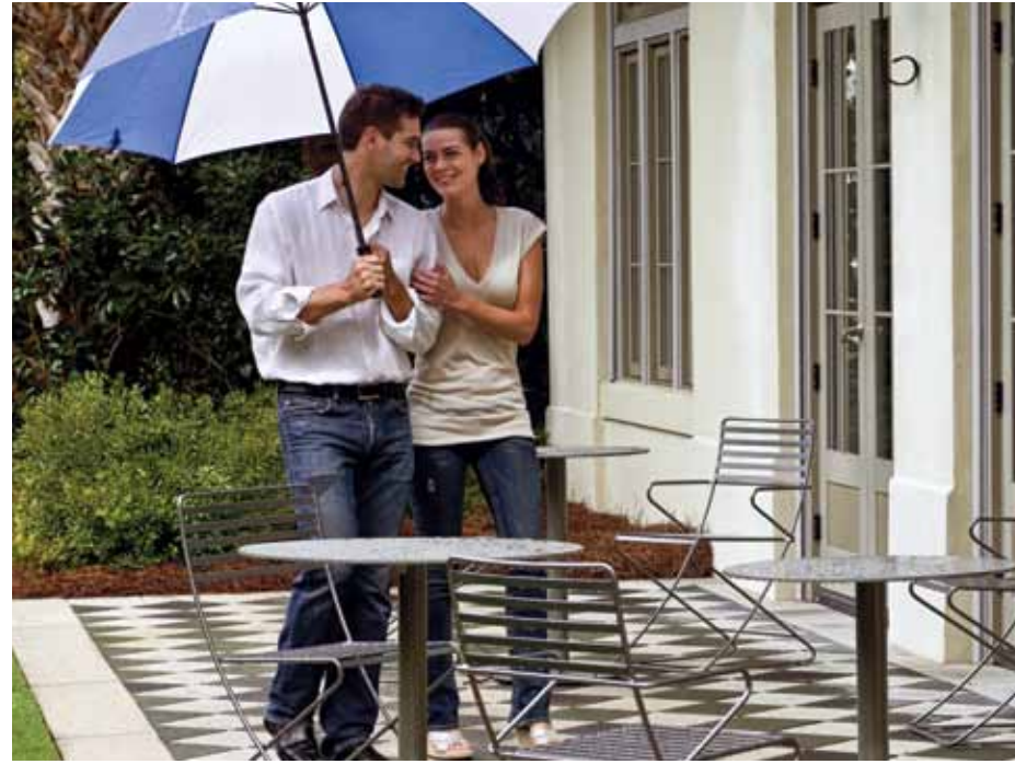
Garden party tasteful... college campus tough