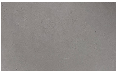
Silver Smoke (Iron Oxide)