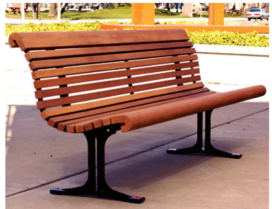
Cover Photo: Shadowline Bench

Consult Landscape Forms price list for complete specifying information. Visit landscapeforms.com ; click Design Tools, Materials/Colors link for standard offerings, including FSC wood options.